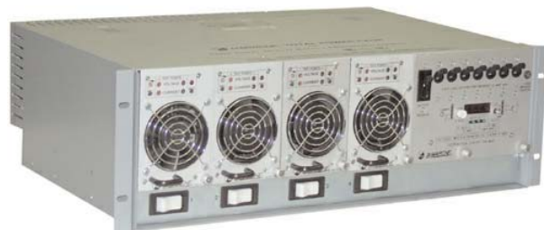
TPC23 cage 23.0" mounting only

TPC Rectifier Cage with (2) TPM Rectifiers and TPCD Fuse Distribution Module