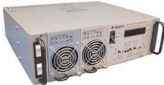
TPC cage 19.0" or 23.0" mounting reversible flange provided

Allow an additional .75 inches (19mm) for handles.