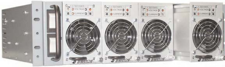
19" and/or 23" TPM Cage shown above with (4) TPM Rectifiers

TPM SYSTEMS SWITCHMODE RECTIFIER SYSTEMS