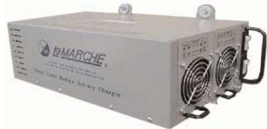
TPW2 Standard (non-hinged) Dual Rectifier Bay shown above