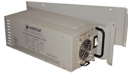
TPWH1 Hinged Single Rectifier Bay shown above with hinge on left hand side