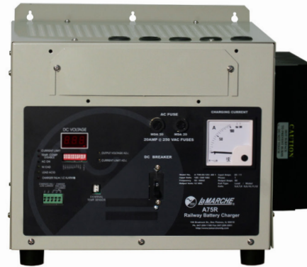
Model shown: A75R-60-12V