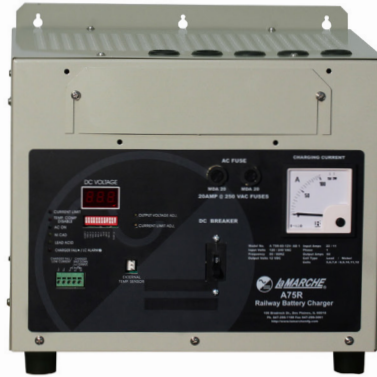
Model shown: A75R-30-24V A75R-40-12V