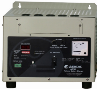
Model shown: A75R-10-12V A75R-20-12V